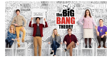
The Big Bang Theory Seasons 1 - 12