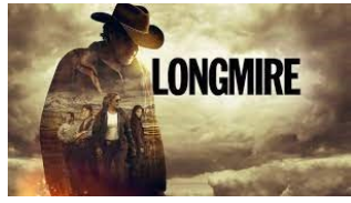
Longmire Seasons 1 - 6