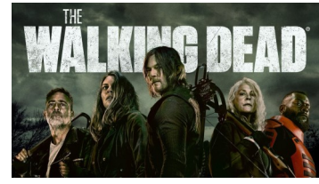
The Walking Dead Seasons 1 - 9