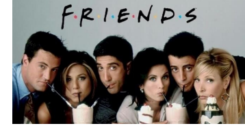
Friends Seasons 1 - 10