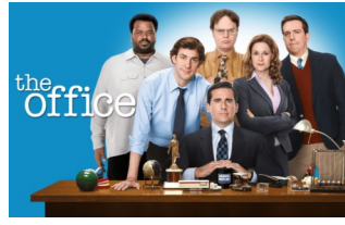
The Office Seasons 1 - 9

We are expanding our DVD collection to include many favorite TV Series.