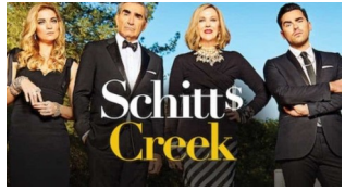
Schitt's Creek The Complete Collection