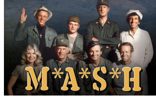
MASH Seasons 1 - 11