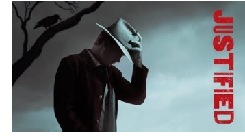
Justified Seasons 1 - 6